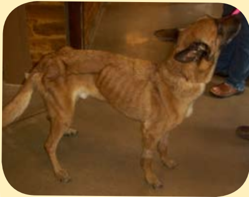
Neeko aftersix weeks of vet care at Alameda East Animal Hospital.

Neeko was discovered by Aurora Animal Care Officers hours from death. He could not move, other than lifting his head a couple of inches and weakly wagging his tail. He was rushed to an emergency animal hospital, where he remained for the next five months until he was deemed sufficiently healthy to be placed into foster care.