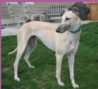
Lizzy The Greyhound