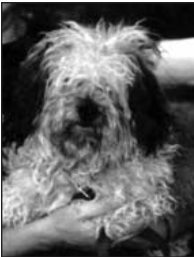
sadie: Before being adopted

Many owners surrender their dogs directly to the rescue groups. Many owners take their dogs to animal