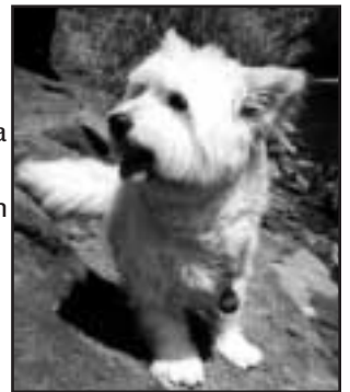
Teddy Bear the Westie

the neck. The chips contain a code which can be read by central databases containing the owners' information. After having the chip implanted, the pet owner mails information to a registry and is responsible for keeping the information up-to-date. Dog collars and tags can easily be removed or lost. Tattoos are painful, difficult to read, and can rub off after awhile. Microchips provide a means of permanent identification.