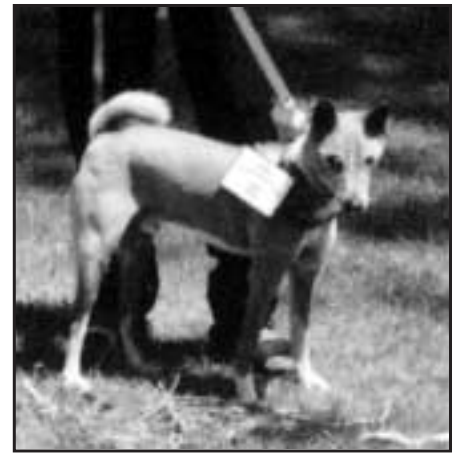
Jabari enjoying a walk in the park