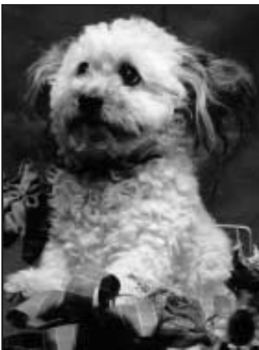
sadie: After being adopted